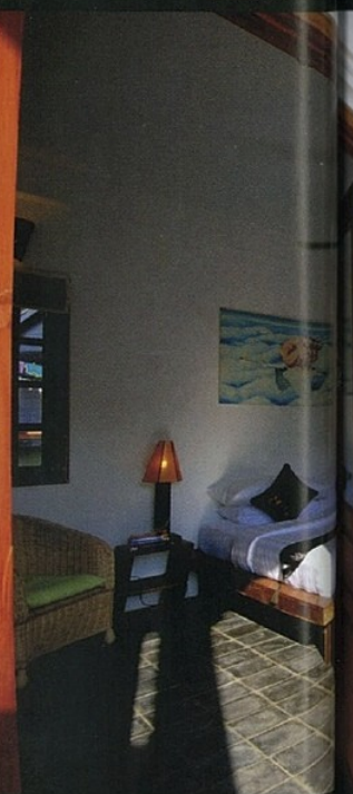
images GOLDEN BANANA BOUTIQUE HOTEL